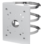
PFA150 Pole mount