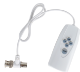
PFM820 UTC Controller